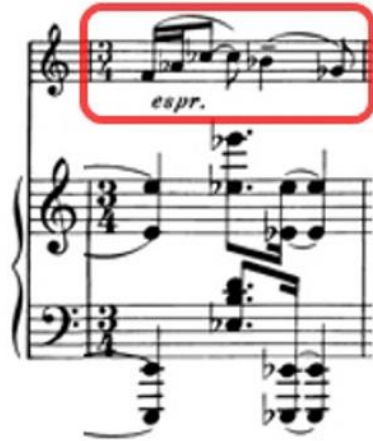
Example 11: Martinu, Viola Sonata No. 1, movt. I, m. 88.