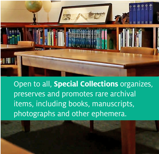
Open to all, Special Collections organizes, preserves and promotes rare archival items, including books, manuscripts, photographs and other ephemera.