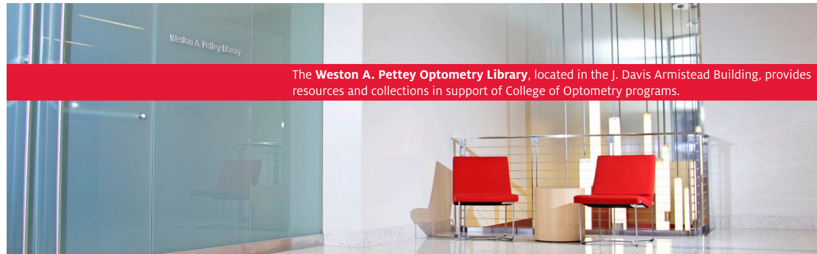
The Weston A. Pettet Optometry Library , located in the J. Davis Armistead Building, provides resources and collections in support of College of Optometry programs.