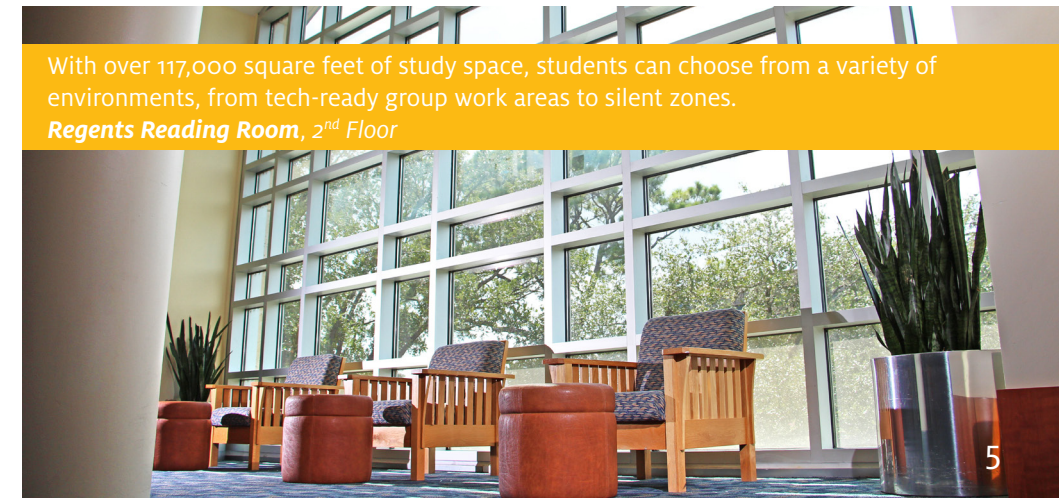
With over 117,000 square feet of study space, students can choose from a variety of environments, from tech-ready group work areas to silent zones. Regents Reading Room, 2 nd Floor