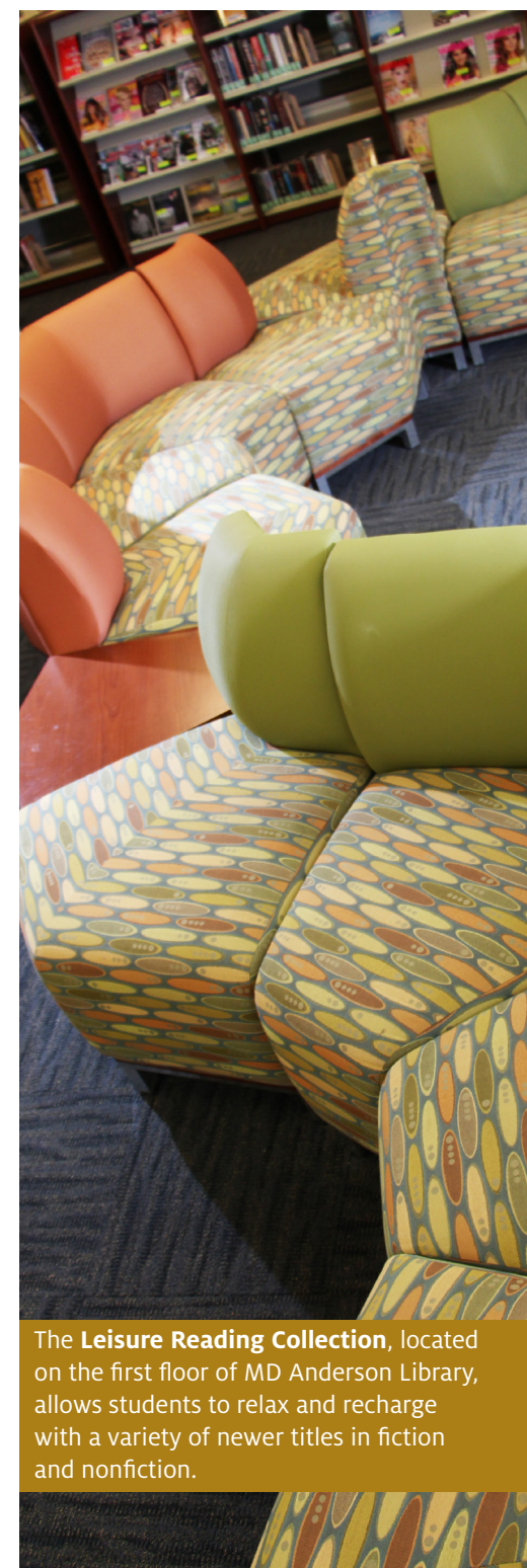
The Leisure Reading Collection , located on the first floor of MD Anderson Library, allows students to relax and recharge with a variety of newer titles in fiction and nonfiction.