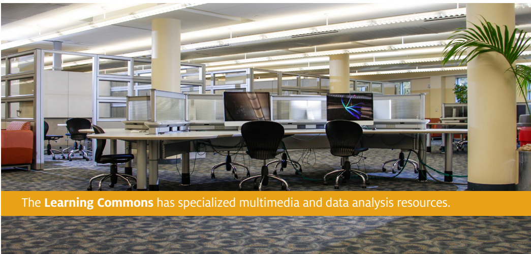
The Learning Commons has specialized multimedia and data analysis resources.