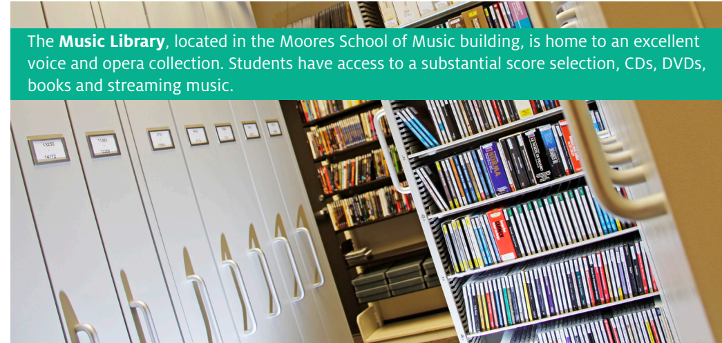
The Music Library , located in the Moores School of Music building, is home to an excellent voice and opera collection. Students have access to a substantial score selection, CDs, DVDs, books and streaming music.

The University of Houston Libraries offers students and scholars an enhanced user experience, with next-level tools and resources within reimagined spaces tailored for finding, creating and sharing knowledge.