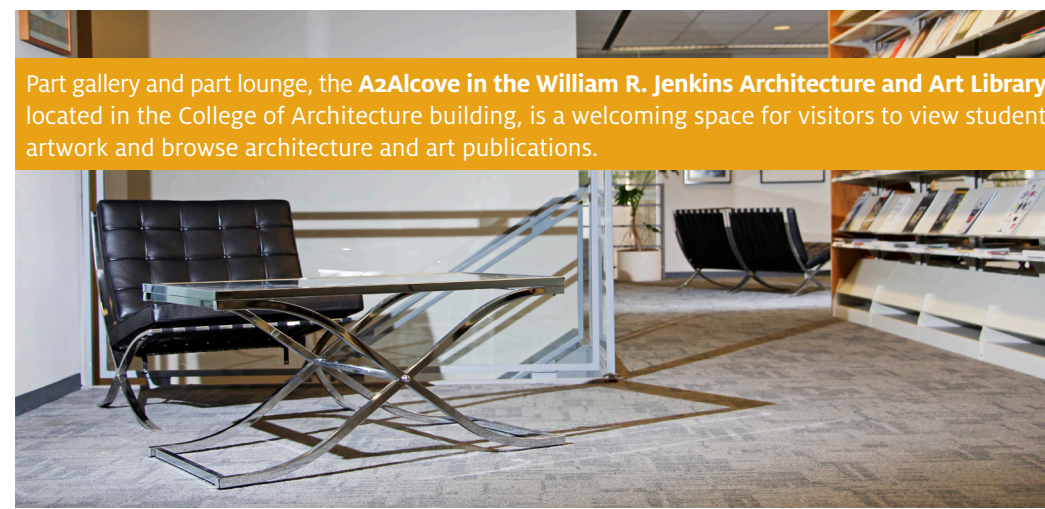
Part gallery and part lounge, the A2Alcove in the William R. Jenkins Architecture and Art Library , located in the College of Architecture building, is a welcoming space for visitors to view student artwork and browse architecture and art publications.