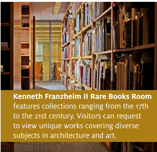
Kenneth Franzheim II Rare Books Room features collections ranging from the 17th to the 21st century. Visitors can request to view unique works covering diverse subjects in architecture and art.