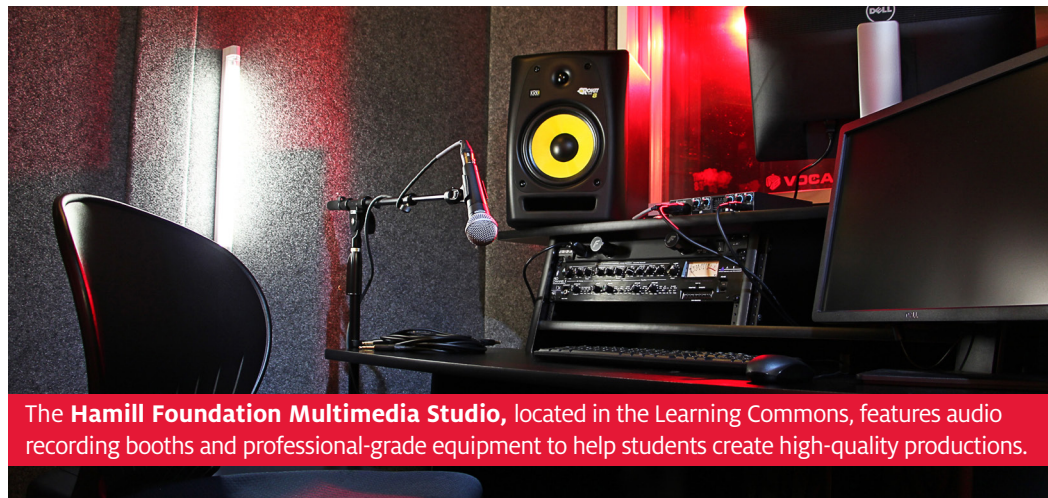
The Hamill Foundation Multimedia Studio , located in the Learning Commons, features audio recording booths and professional-grade equipment to help students create high-quality productions.