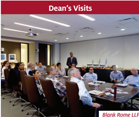
Blank Rome LLP