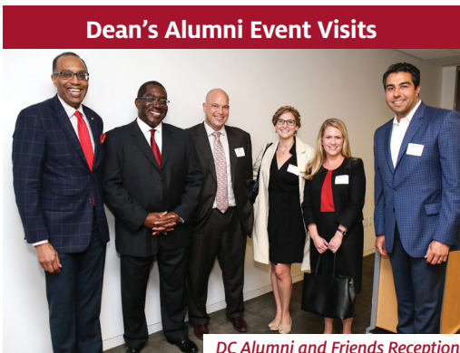
DC Alumni and Friends Reception