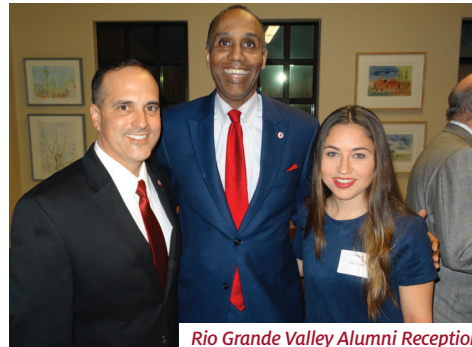
Rio Grande Valley Alumni Reception