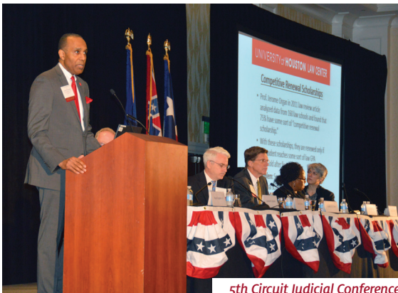
5th Circuit Judicial Conference