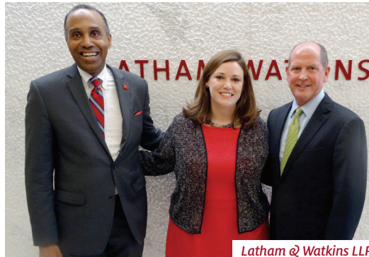
Latham & Watkins LLP