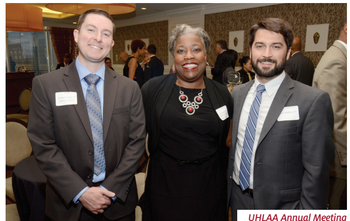
UHLAA Annual Meeting