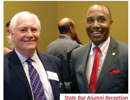
State Bar Alumni Reception