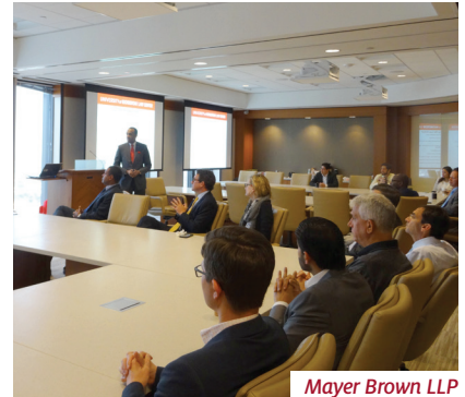
Mayer Brown LLP