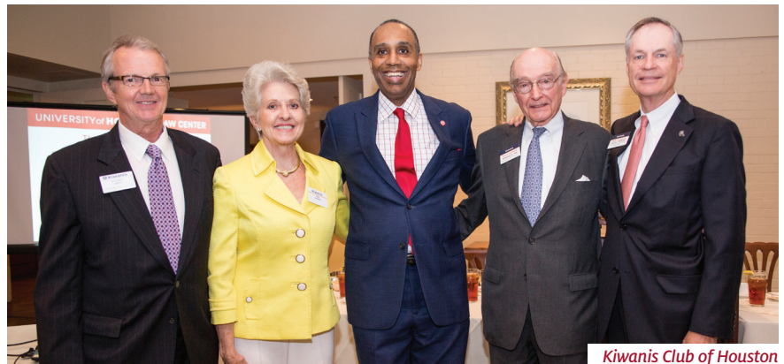
Kiwanis Club of Houston