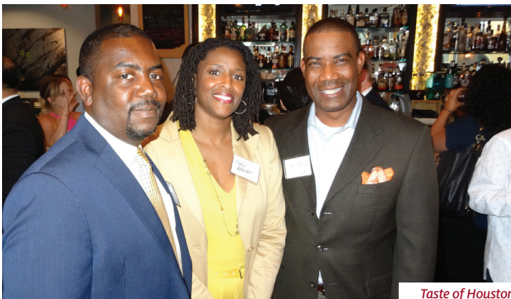
Taste of Houston