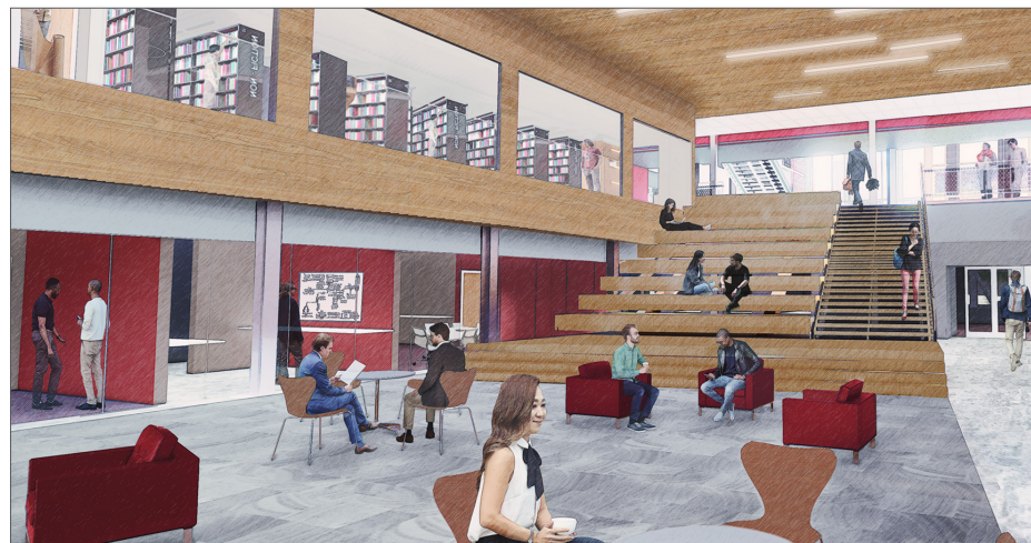
Preliminary digital rendering of the library provided by Shepley Bulfinch.