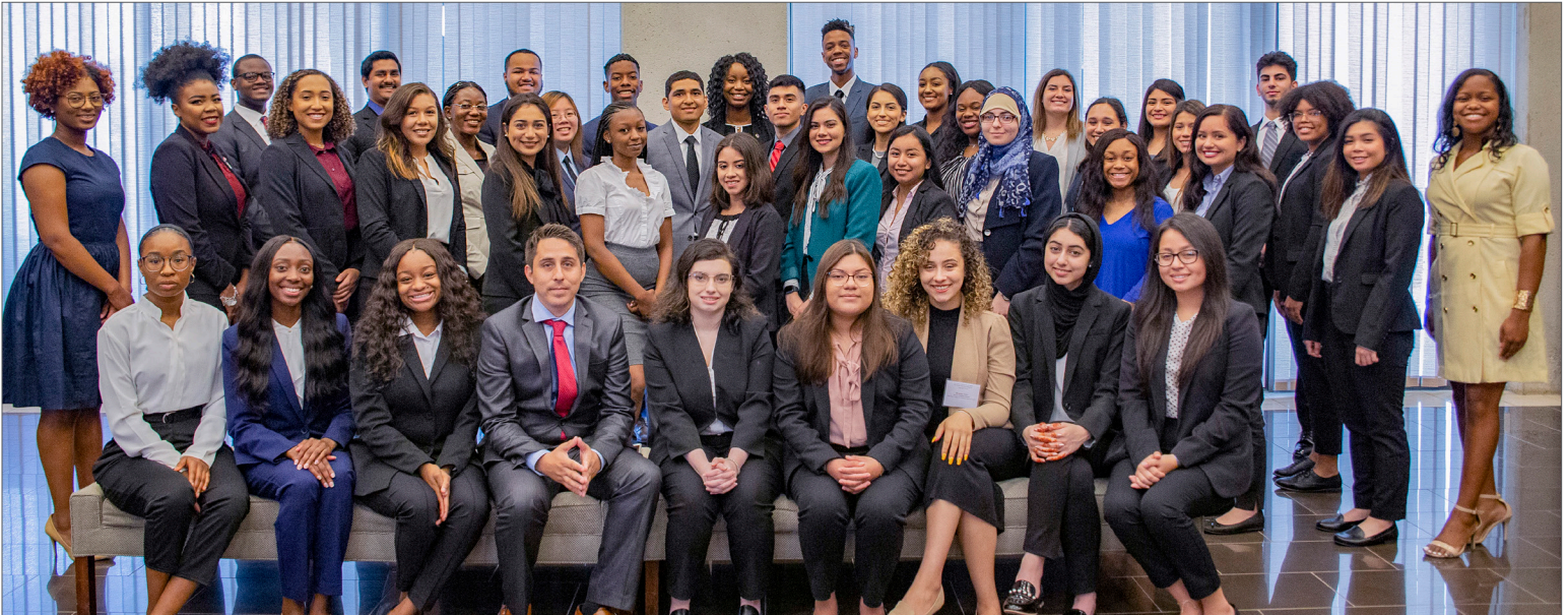
2019 PreLaw Pipeline Class

In June, the University of Houston Law Center welcomed 42 undergraduate students from 28 colleges across the nation to its Pre-Law Pipeline Program.