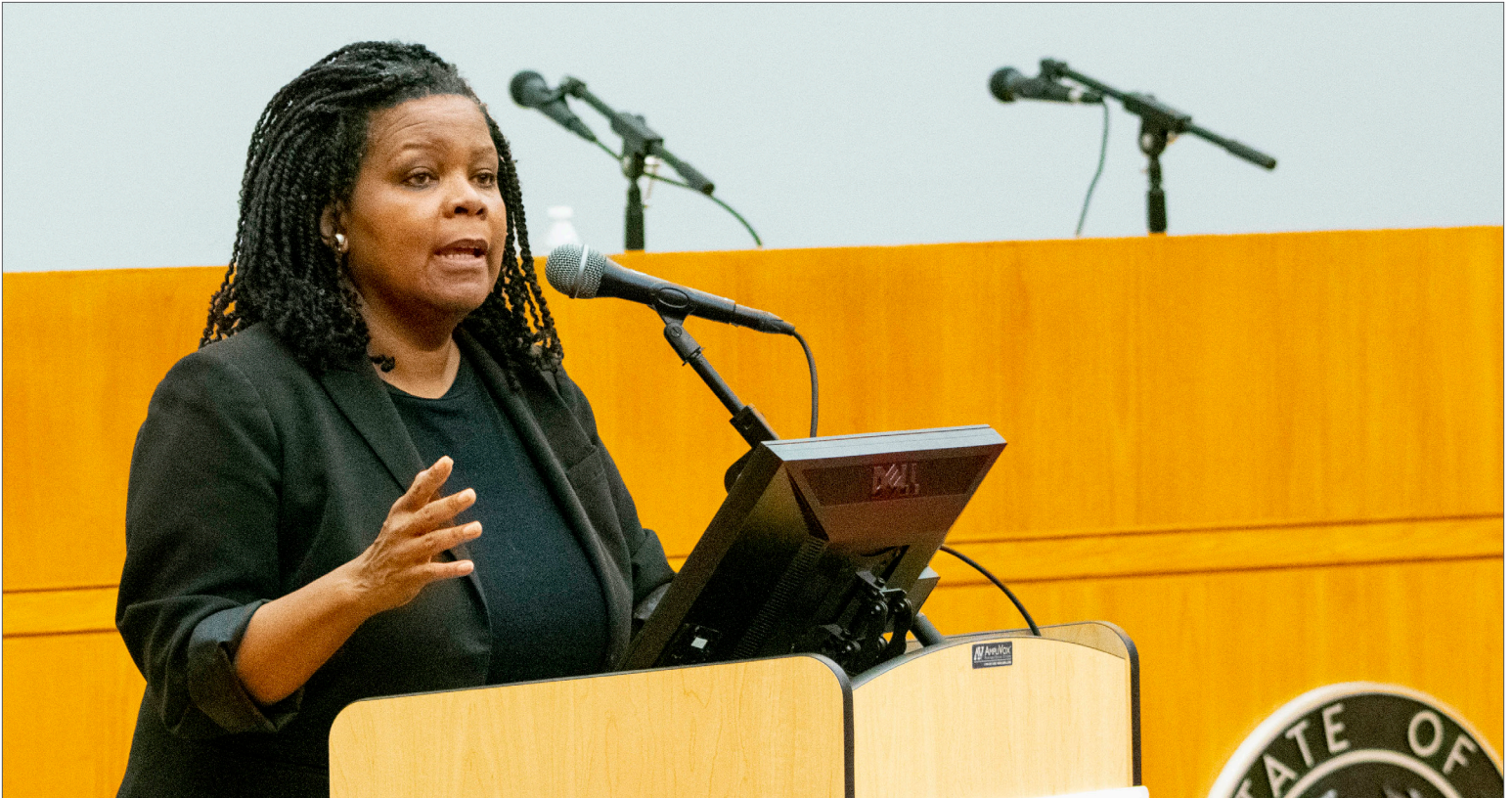
Annette Gordon-Reed spoke in observance of Black History Month and as part of the 2019 Dean's Distinguished Speaker Series.