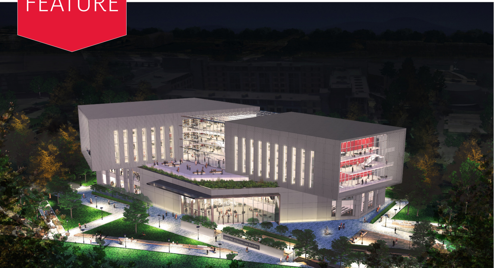
Preliminary digital rendering of the University of Houston Law Center provided by Shepley Bulfinch.