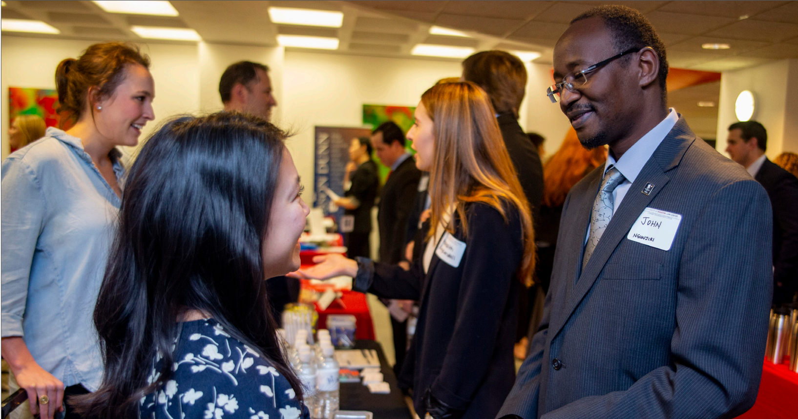
University of Houston Law Center students filled the Commons for the Career Development Office's networking event.

First-year University of Houston Law Center students networked with well-known companies, law firms and state agencies during the "Meet the OCI Employers" gathering in December.