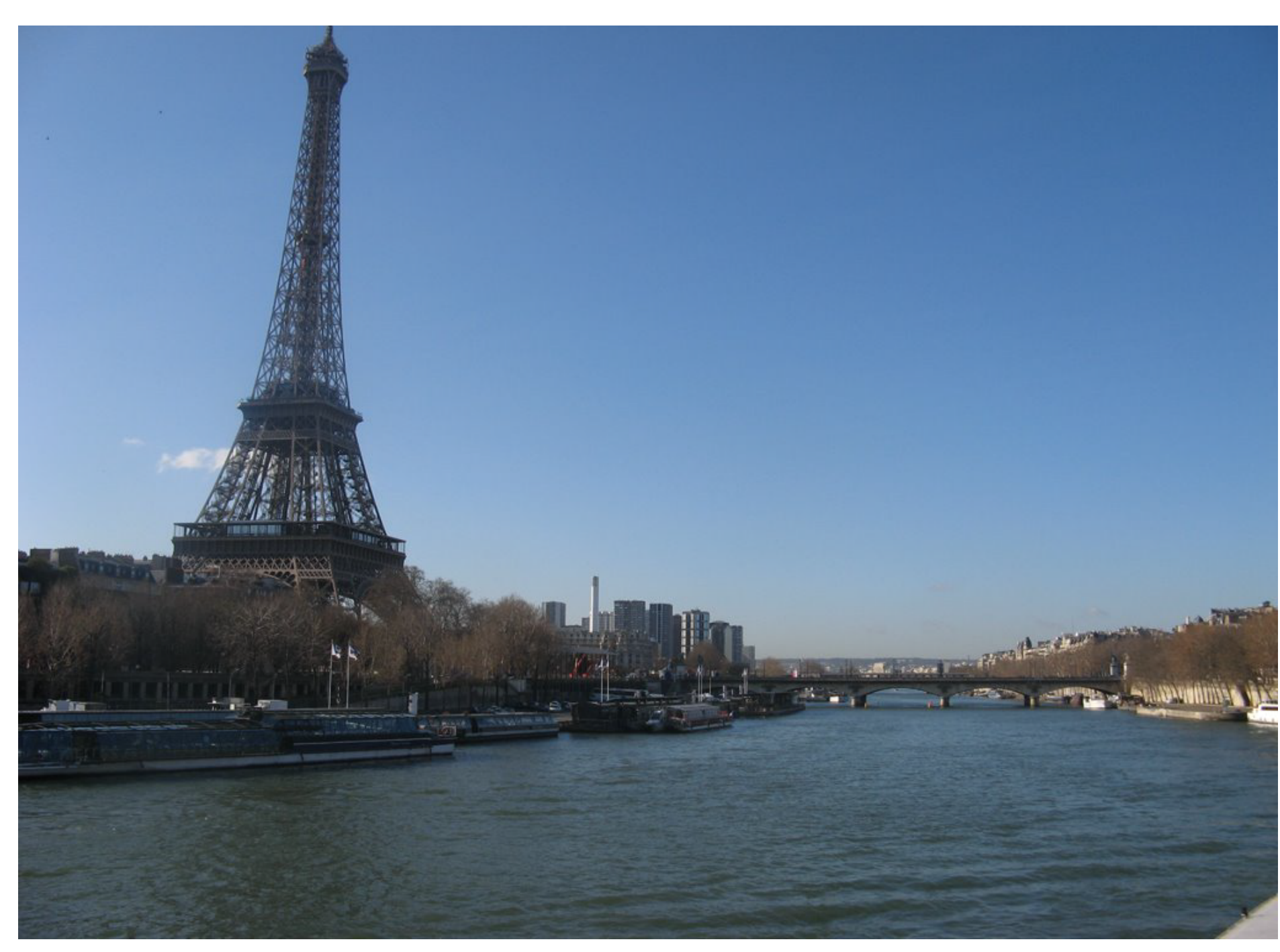
Seine River at normal level.