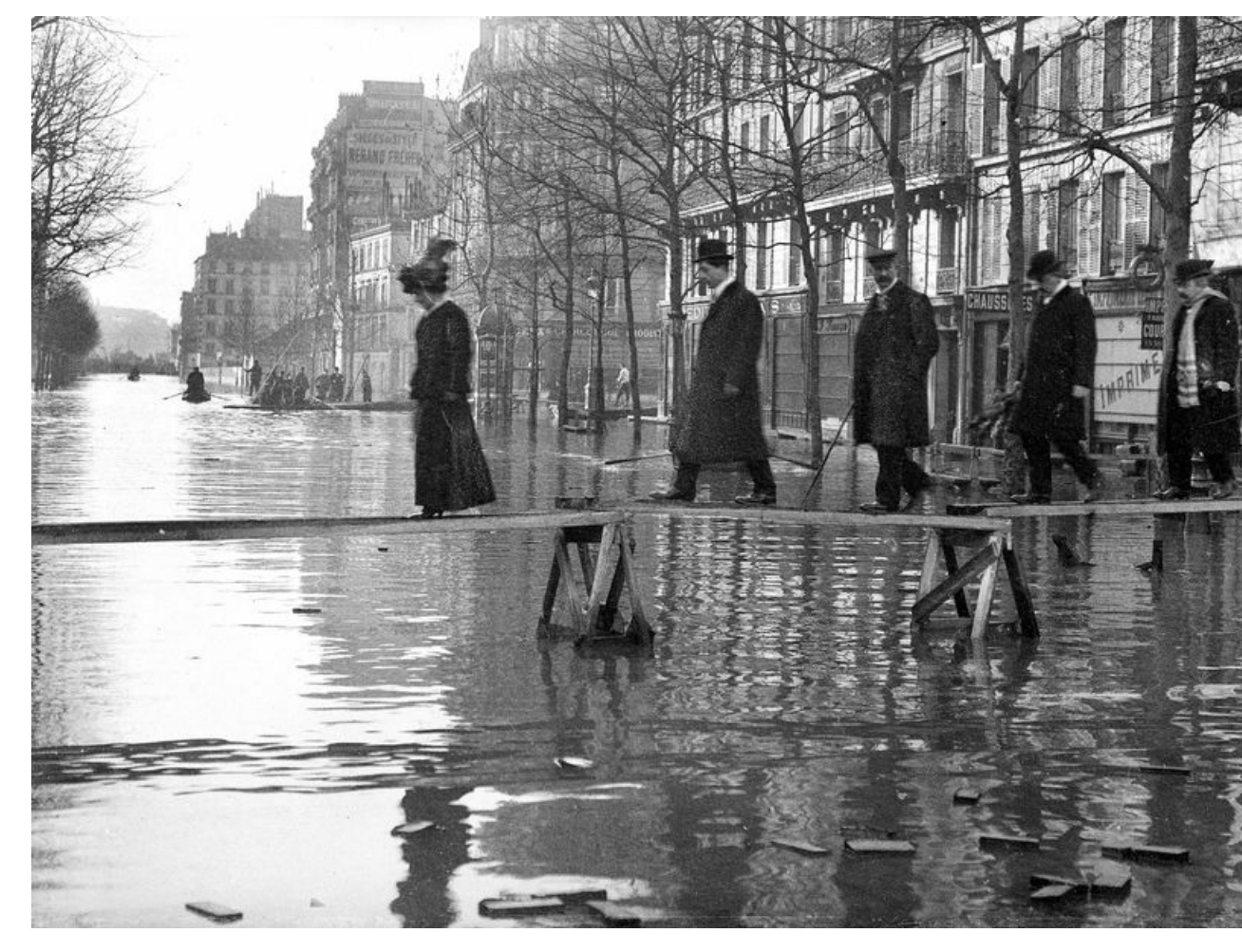
Make shift bridges keep people out of the polluted water.