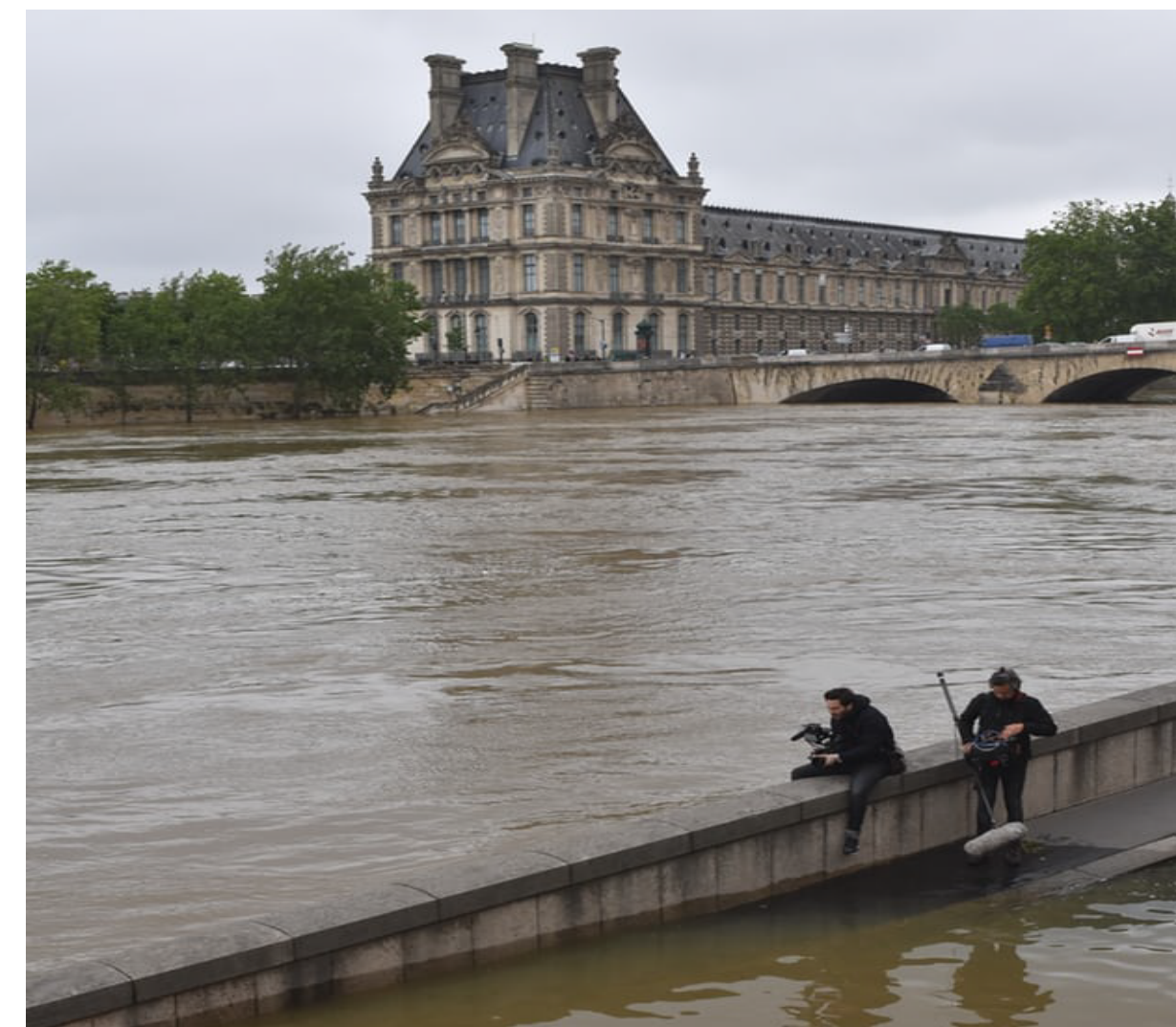
These photos show the Seine River flooding over its banks in June 2016.