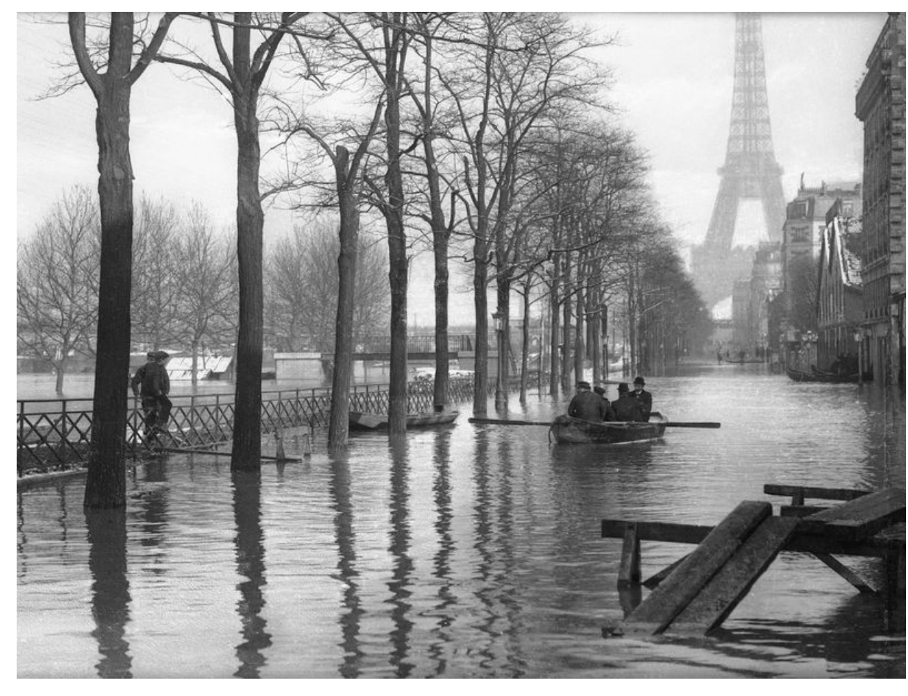
Parisians used boats to navigate the streets.