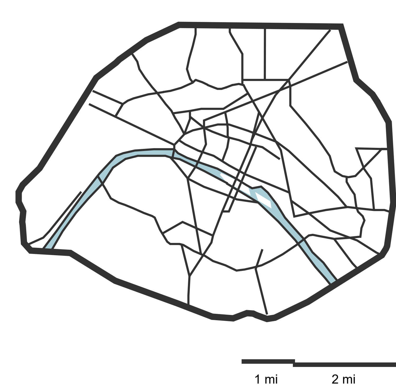
The Seine River