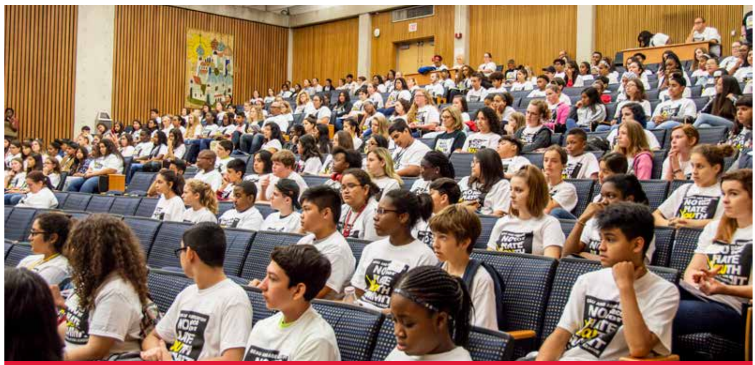
Middle school students attend No Place for Hate Youth Summit in Krost Hall.

After an introduction in Krost Hall, students broke into groups throughout the Law Center to further develop skills to identify and interrupt bullying on their respective campuses.