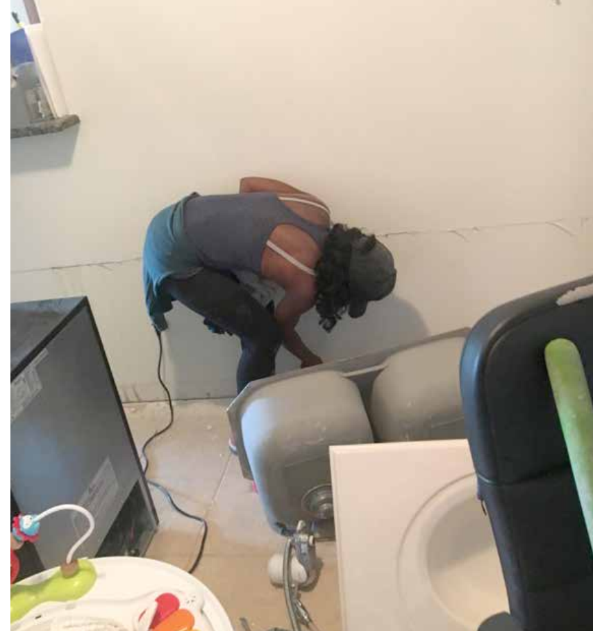
UH Law Center Young Alumni Committee members volunteered to help many Hurricane Harvey victims.

Subjects covered a wide range of storm-related issues facing homeowners, tenants and businesses, including insurance coverage, FEMA qualifications, landlord/tenant disputes, contracts, price gouging and scams.