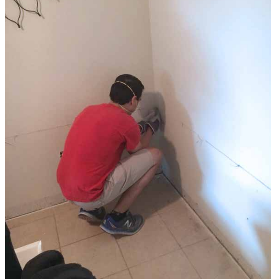
UH Law Center Young Alumni Committee members work on flood cut and drywall removal in the aftermath of Hurricane Harvey.

go directly to support immediate needs in our city."