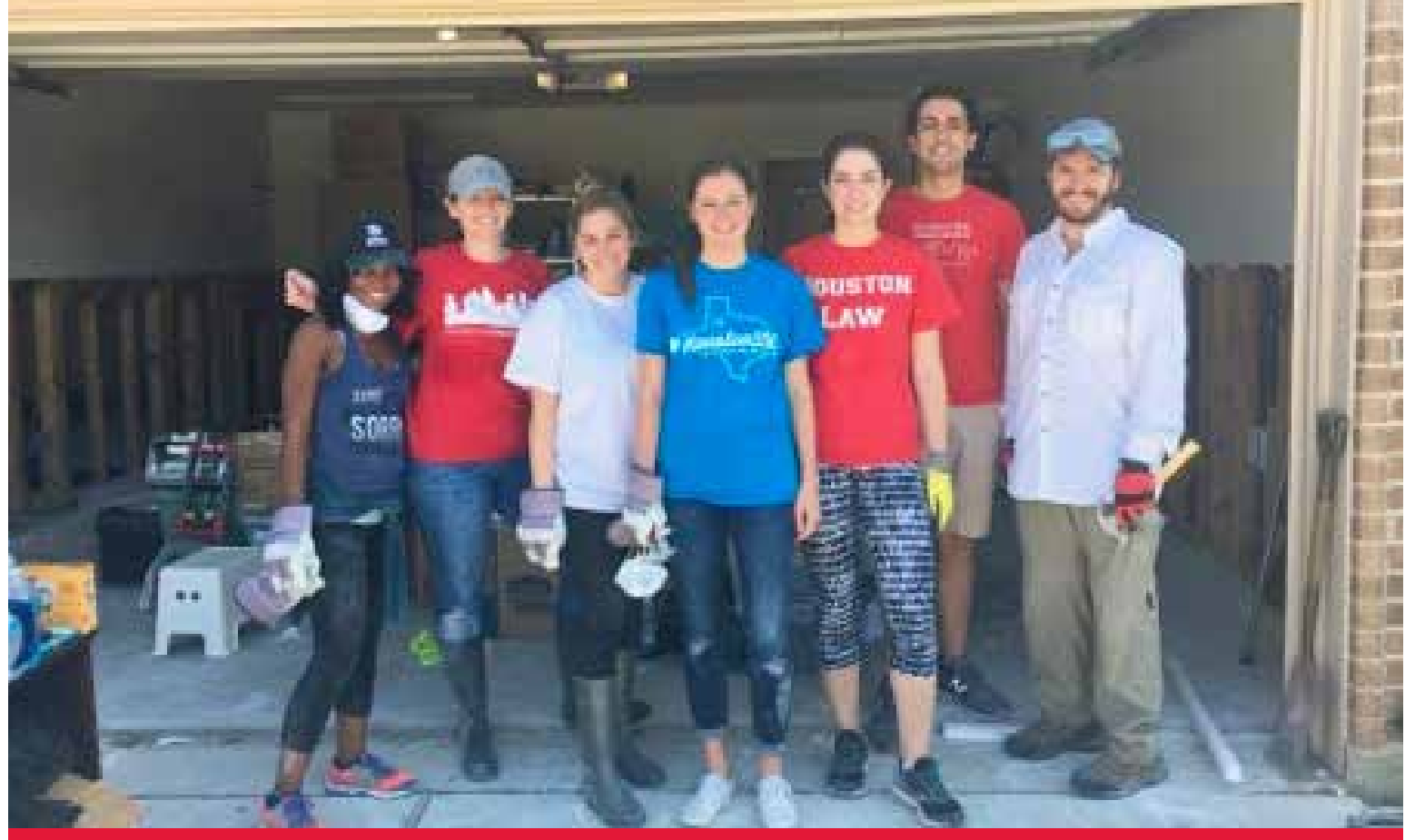
UH Law Center Young Alumni Committee members assist with Hurricane Harvey cleanup.

Faculty, staff, and students completed surveys to assess Harvey's impact. Every student, full-time faculty and staff member were accounted for after the storm.